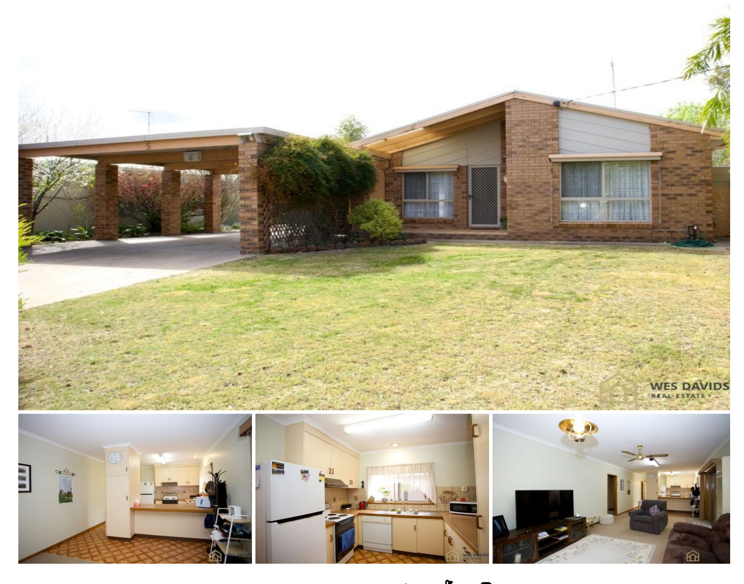
5 De Castella Drive Horsham VIC

Why buy a weatherboard property when you can get a brick home at this price? This family brick-veneer features a formal lounge and dining room, laminex kitchen overlooking the meals and family room, ensuite to the master bedroom, gas heating and evaporative cooling. Outside there is a double carport, huge shed and a paved pergola perfect for entertaining. It is currently rented at $285 per week.