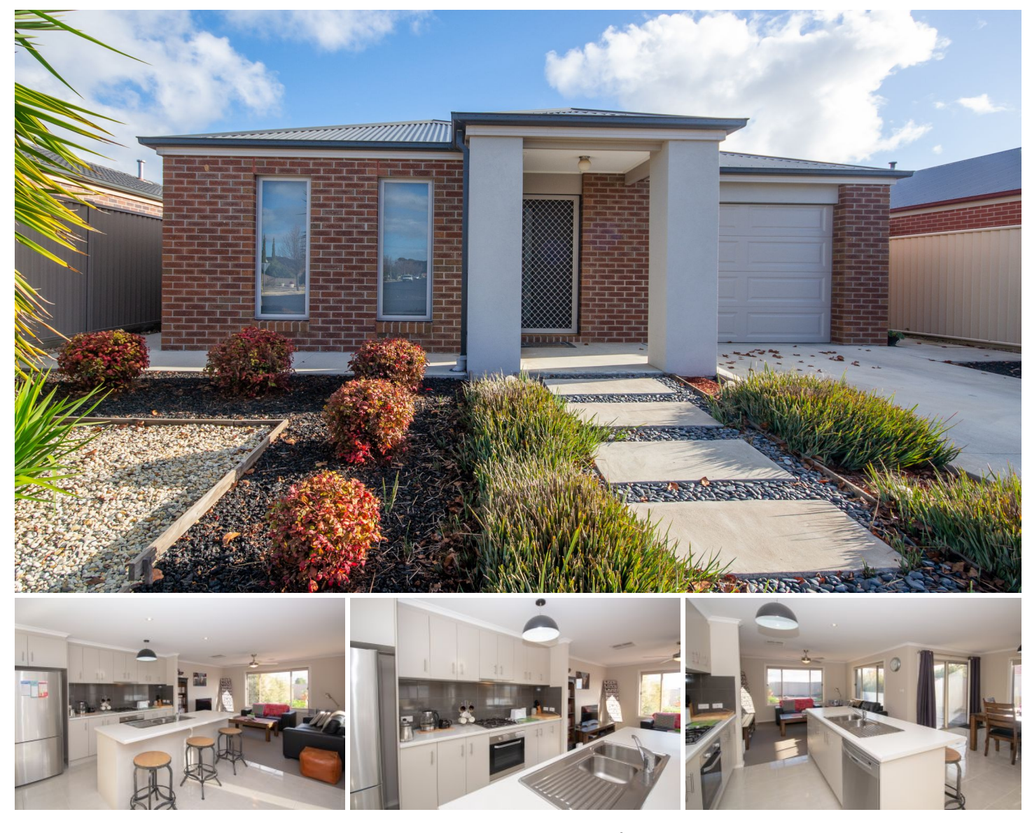
2/70 Hillary Street Horsham VIC

This well-presented townhouse is the perfect option for those wanting to live the low-maintenance lifestyle. The open-plan kitchen with walk-in pantry, dining and living area is at the rear of the home, plus there is also a separate second living area which could be used as an office. There are three bedrooms with an ensuite and walk-in robe to the master, an undercover alfresco area and a low-maintenance backyard. Ducted gas heating and evaporative cooling complete this easy-living property.